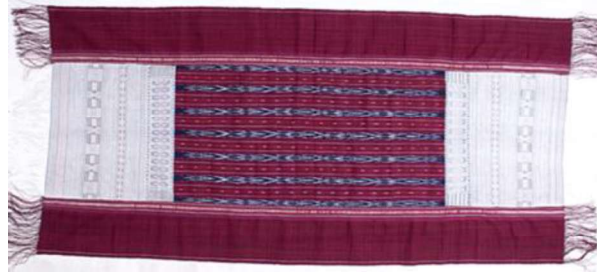
Figure 1: Ulos Ragidup

to weave three different parts: head side, middle side, and bottom side. This Ulos is worn by adult male, not for children. The anatomy of this Ulos can be seen in Figure 1.