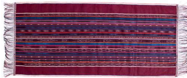
Figure 2: Ulos Harungguan

This type of Ulos has combination of all other types of Ulos. This type of Ulos is to be used by married females only. The price of this type of Ulos is relative higher than other as it has rich of patterns that require more effort of the weavers to produce this type of Ulos. Figure 2 shows the anatomy of this type of Ulos.