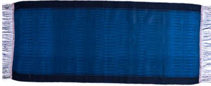
Figure 4: Ulos Sibolang