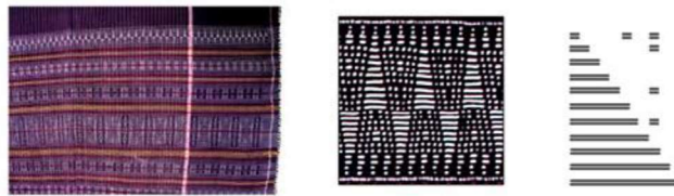
Figure 10. Sample of Decorative Illustration

How destination branding will promote tourism in Toba Highland is presented in this sub section. Destination branding itself could be defined as a name, symbol, logo, word mark or other graphic that both identifies and differentiates the destination [8]. In building a destination branding, it is important to consider local people as a stakeholder, due to strong relationship between consumer (visitor) and local people [9]. Moreover, it is vital to put emphasize on capturing the spirit of people in the branding [10].