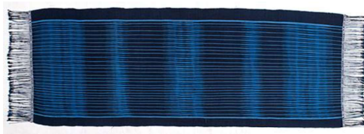
Figure 5: Ulos Sitolutuho

This Ulos is quite similar with Ulos Sibolang which has blue, black, and white in color. However, this type has more compact patterns which require more effort to weave thus the price is higher. This Ulos has been used widely as accessories, head band, and scarf for ladies. In Batak traditional ceremony, it is given as a gift from parents to their daughter. Anatomy of this Ulos can be found in Figure 5.