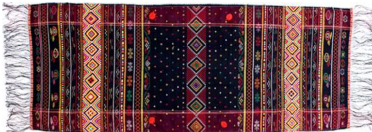
Figure 6: Ulos Sadum

This type of Ulos has many patterns and colors which reflects joy and happiness. This Ulos is commonly worn by females and also used as wedding gift in Batak wedding ceremony. Figure 6 shows the anatomy of this type of Ulos.