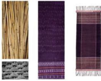
Figure 8. Components that Build Ulos Ragihotang

approximately same vertical interval. The rattan and the ties make two distinct sections. While the rattan repeats itself horizontally, the bottom ornamental repeats both vertically and horizontally. The end ornamental has several sections which has its own distinct pattern made from repeating white thread and another ornaments in color red-yellow thread. Each white ornament section is alternated with color ornament section. In every white ornament section there is a distinct red line across the repeating pattern.