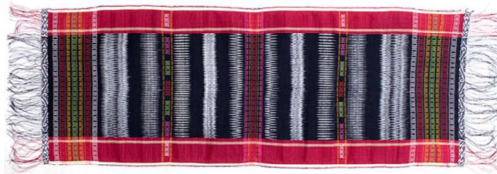
Figure 3: Ulos Bintang Maratur

This type of Ulos consists of some rows of stars in a regular order. This is a symbol of a steady life of happiness and harmonization. In traditional Batak ceremony, this Ulos is given to an expecting mother by her parents. Figure 3 is the anatomy of Ulos Bintang Maratur.