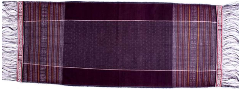
Figure 7: Ulos Ragihotang